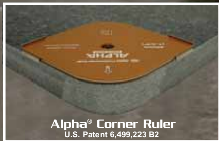
Alpha® Corner Ruler U.S. Patent 6,499,223 B2

Alpha® Contour blade together with the AWS-125 Stone Cutter allows fabricators to cut a sink hole along the cut line quickly and safely. In order to shape the edge to a desired profile, Alpha® introduces the Profiler Z-Series, Vertical Grinding Wheels.